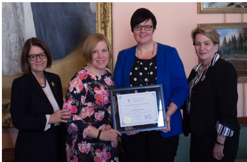
Staff of Forest Hills School receiving an 'Inclusive Education Award' from the New Brunswick Association for Community Living.

It is encouraging to report that the local school district has become much more aligned with provincial policy and expectations for inclusive education. It is both exciting and rewarding to know that Forest Hills School has been a determined and effective advocate of inclusion.