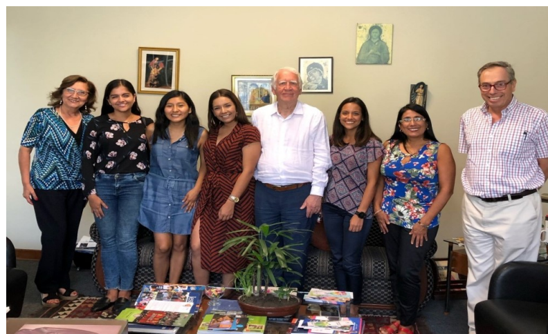
De La Inmaculada leaders, SPSP staff and visitors

In order to align the school's practices with a vision of inclusion and equity, school leaders made time and space for very careful preparation for change.