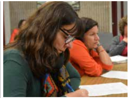
Participants taking notes at Woodstock High School