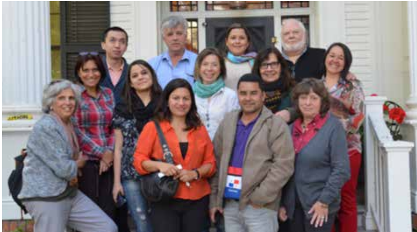
Tour Participants at Connell House in Woodstock, NB

Honduras, El Salvador, Nicaragua, China and the Czech Republic.